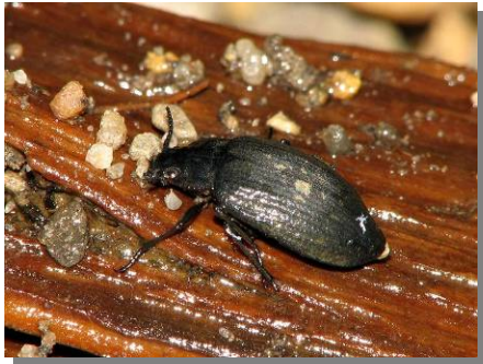
Amphizoa lecontei

The beetle fauna from this survey shows similar tendencies. Several of the higher alpine species are clearly associated with the northern mountains, such as Pterostichus (Cryobius) brevicornis (which also happens to be a first Alberta record). Other elements clearly show close affinities with the Columbian fauna, such as Derodontus trisignatus , Myrmecocephalus arizonicus , Sphaerites politus , and Amphizoa insolens . Two other source regions are the more southern Rocky Mountains and the boreal forest. These two regions perhaps contribute the most species to the park's insect fauna. Species such as Nebria schwartzi (and most of the other Nebria species), Amphizoa lecontei , many of the Bembidion species, and some of the Amara are truly mountain species. Boreal elements are strong in this area, but some species are nearing the western edge of their distribution (e.g., Blethisa julii , Oiceoptoma noveboracens ).