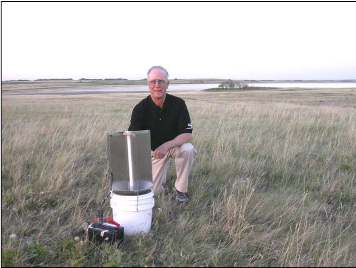
Native grasses, Prairie Crocus and Three-flowered Avens; Lowden Springs Conservation Area, looking ENE towards Lowden Lake, June 3, 2004.

The present paper incorporates the information in previous reports along with that gathered in 2009. It also includes a number of redeterminations and additions to the information in the earlier reports.