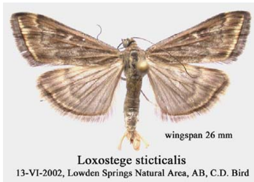
Plate 1. Some Moths of the Lowden Springs Natural Area.