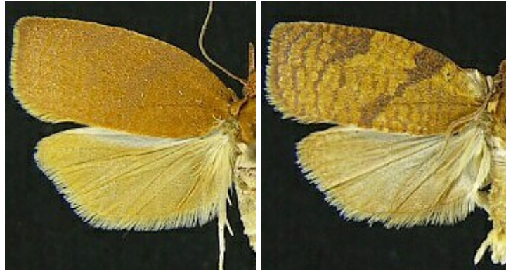
Sparganothis directana , both images from the Moth Photographers Group web site.