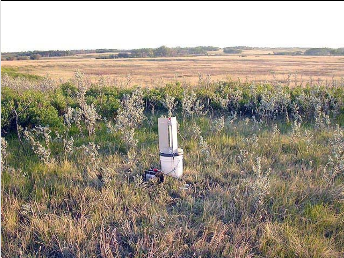
A stand of Silver Willow and Buckbrush in the middle of the Lowden Springs Natural Area, 4 June 2004

are 52.09N and 112.425W and the elevation there is 830 m. Historically, the land was part of the Randon Ranch and was grazed for pasture. Small upland portions were broken up many years ago and the native vegetation was destroyed, however, much of the area still has the original native vegetation as indicated by the presence of plants like Prairie Crocus ( Pulsatilla ludoviciana ) and Three-flowered Avens ( Geum triflorum ).