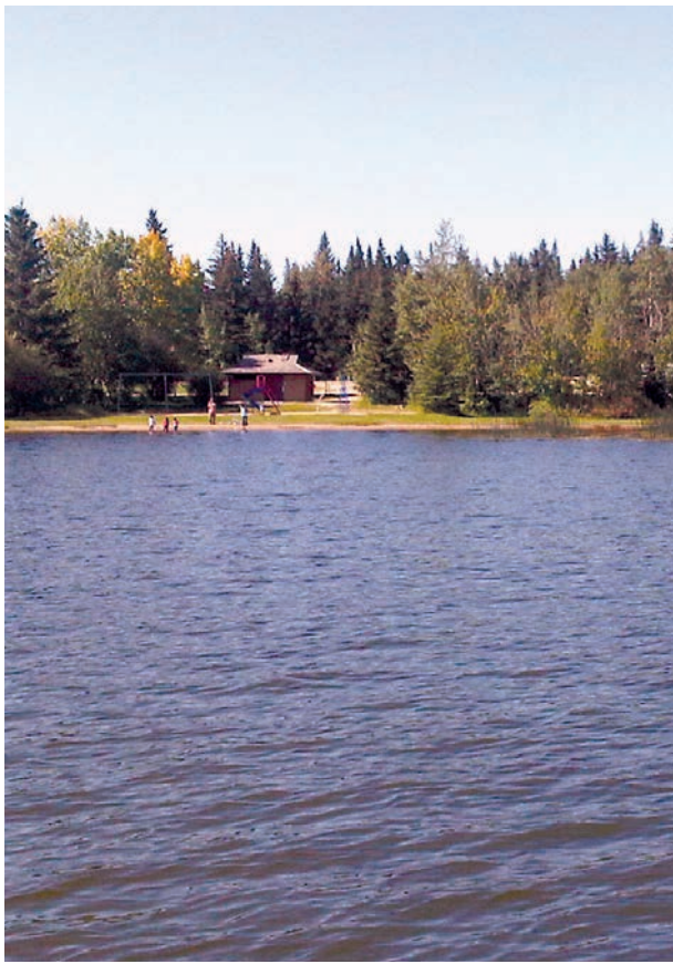
Sturgeon Lake at Williamson Provincial Park