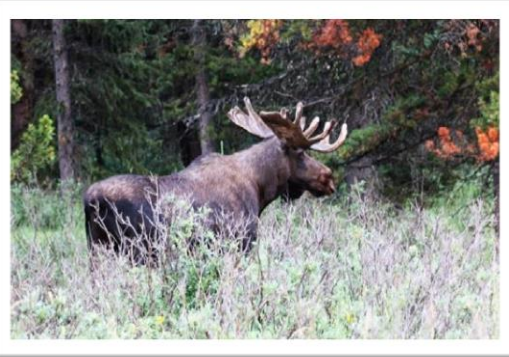
Bull moose (A.Cole)