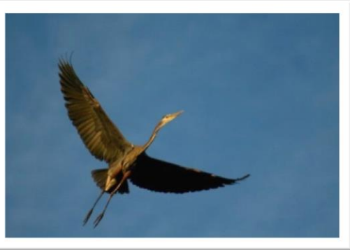
Great blue heron (A.Cole)