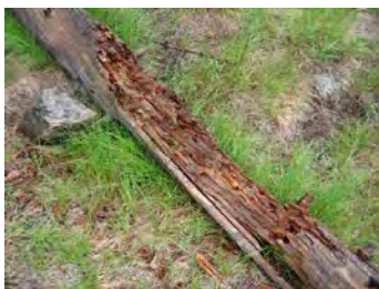
Bears tear at rotten logs looking for insects

Learn more about bear safety at www.wildsmart.ca